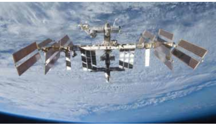
NASA has explored photocatalytic technologies as a means for keeping space environments such as the International Space Station clean.

NASA has explored the beneficial applications of a process called photocatalysis for use both in space and on Earth. Photocatalysis is essentially the opposite of