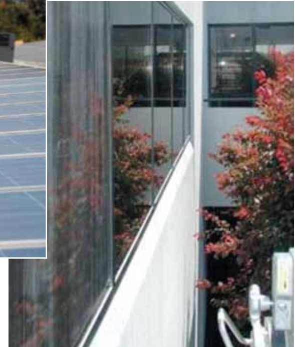
PURETi's photocatalytic solutions keep building surfaces (left, with the treated segment on the left), solar panels (above, with treated cells in the foreground), and windows (right, with treated windows toward the middle) free of grime—reducing maintenance costs, increasing efficiency, and providing all of these surfaces with air purifying capabilities.

A number of projects are also testing the ability of PURETi's solutions to keep solar panels clean for longer, improving their efficiency. The company even collaborated with an architectural firm to transform the firm's massive modern art sculpture—called Wendy and on display at the Museum of Modern Art's Queens, New York, campus in 2012—into perhaps the world's most unusual air purifier.