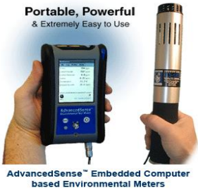
GrayWolf AdvanceSense TVOC meter

Over 60% improvement in indoor VOC levels after treatment